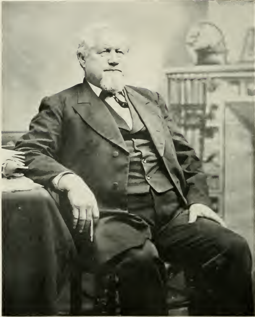
HON. JOHN McAULEY PALMER.